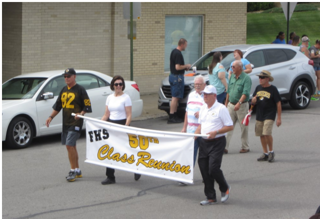
The Class of 1966 marches in the Homecoming Parade on September 9 with the Foundation's 50th anniversary banner. They were the first class to use the 50th banner in a parade.

The Fulton Public Schools Foundation is a 501(c)(3) non-profit organization dedicated to enhancing and enriching the educational experiences for students in our public school system.