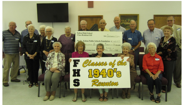
Members of the Reunion Classes of 1946, 1947 and 1948 held a joint reunion the weekend of September 17.