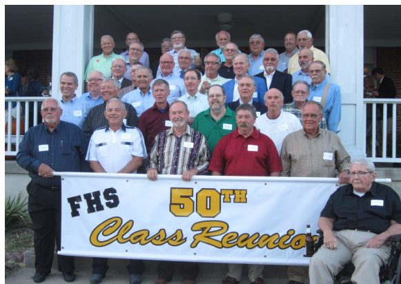
The Gentlemen of the Class of 1967