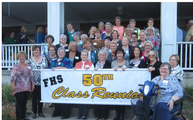
The Ladies of the Class of 1967